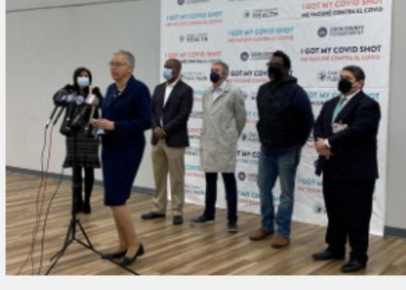
Cook County leaders spoke with the media prior to the opening of the Forest Park vaccination site.