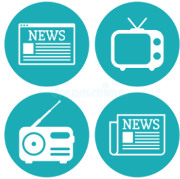
Total Media Placements