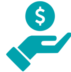
Total Media Value