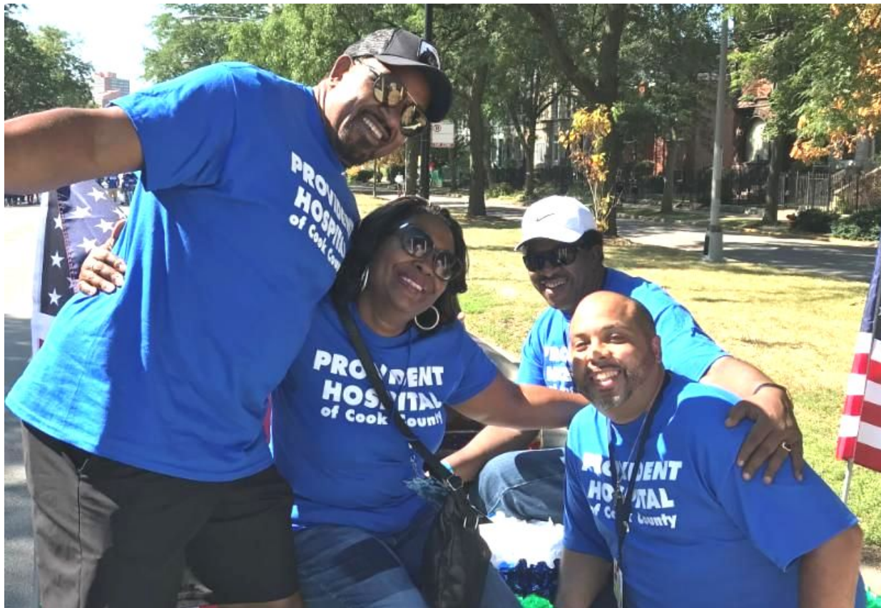
Cook County Health employees and their families took part in the Bud Billiken Day Parade by riding our float.